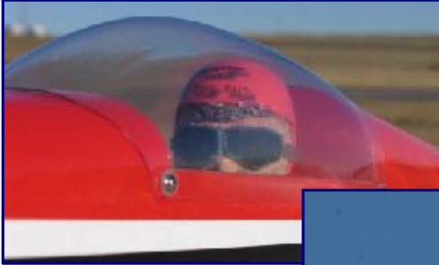
Above: Let's go racing.