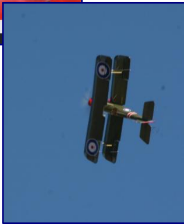
Right: Zac Roller's New Electric SE 5.