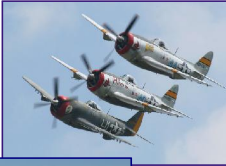
Right: Here's a sight you don't see every day -- and it is from an air show in California with no help from Photoshop.